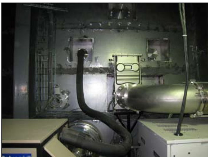
SNS Sequoia Detector Vessel wall section in way of cryogenic and vacuum pumps (pumps shown in the foreground)